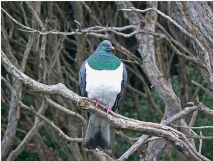
Kereru, Tree Top Drive, Portobello