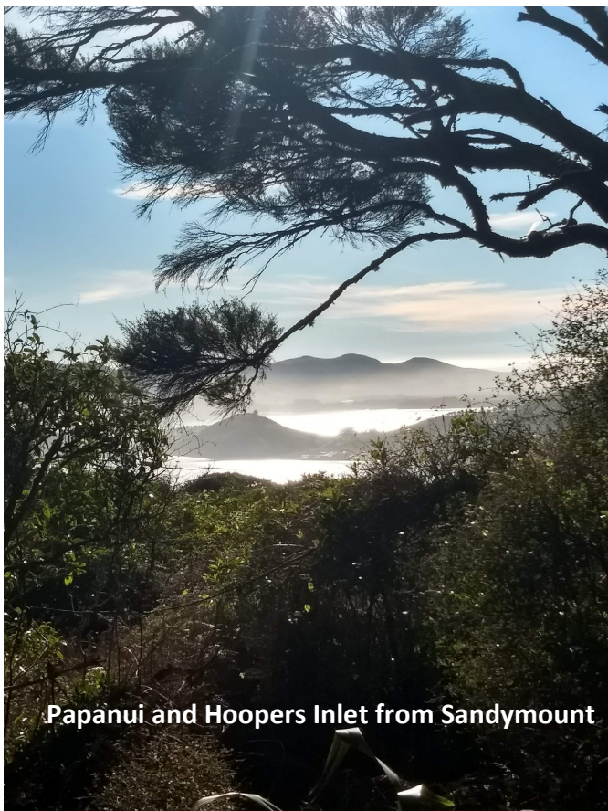
Papanui and Hoopers Inlet from Sandymount

Toward the end of August, we will post our OPBG spring time activities on our Facebook page so be sure to follow us